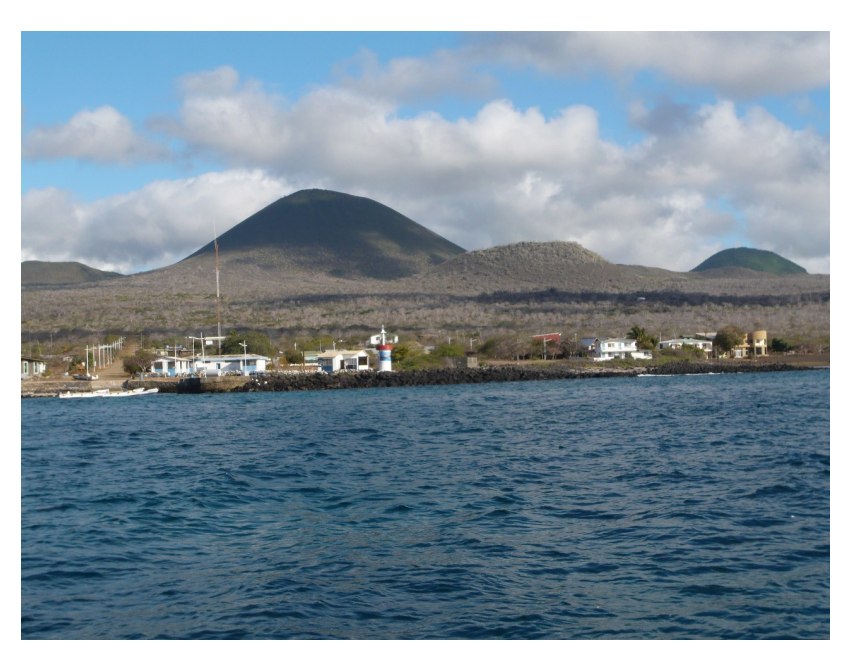
Fig 5. Puerto Velasco Ibarra.

To survive as a community, the scarcity of water has forced the people of Floreana to be disciplined in their consumption, which is restricted to around 30 litres per week per inhabitant (D'Ozouville, 2010). The lack of water is a frequent concern and topic of conversation, just like the ever-changing, unpredictable weather. This is explained by some as a sign of "climate change" and by others as a divine punishment, but the majority of residents view the weather as simply another variable in the island's untamed nature that only the toughest can adapt to: nature overcomes any attempt not only to tame it but also to predict and regulate. The third major topic of conversation on the island is the sea.