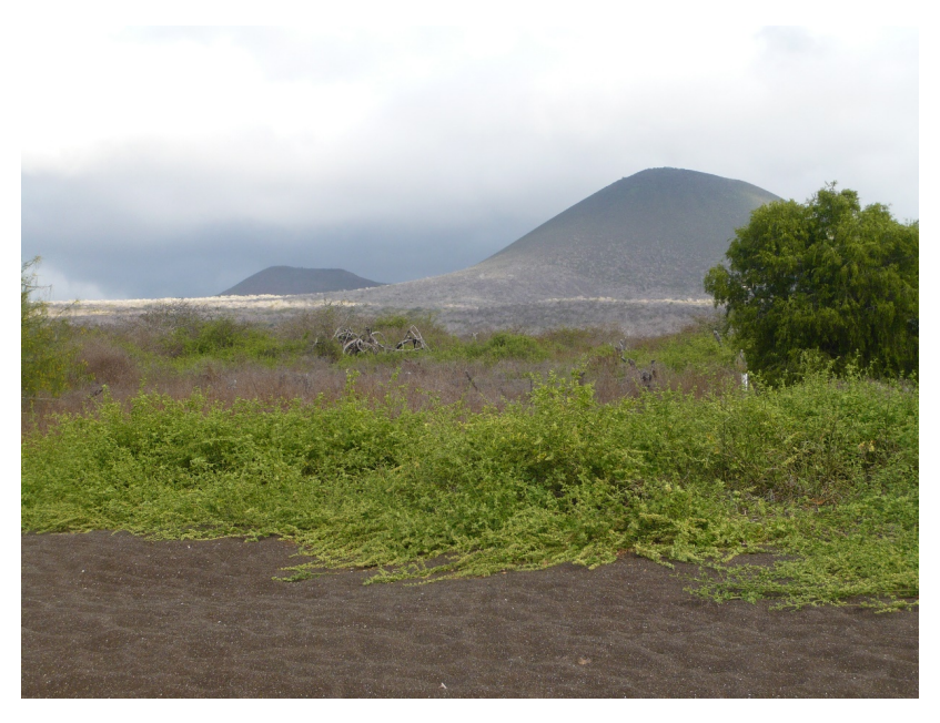
Fig 6. View of Cerro Pajas from Playa Negra.

Between the coast and the croplands around the Cerro Pajas volcano, there is only a difference of 400 metres in altitude and five kilometres of road, but this is enough to mark out two different worlds in terms of experience and conceptualisation (Plate 6). It would appear that, in the praxis of flight or escapism pursued by these islanders, there is a need to remove themselves once again and even further from civilisation. If sailing west to a practically deserted island was the escapist leitmotiv a few years ago, the time has now come to climb up to Cerro Pajas, a move that is not without images of spirituality for them: "I have to get away every day, even if it's just for a while up here... Here, I feel at peace, with the plants, the animals".