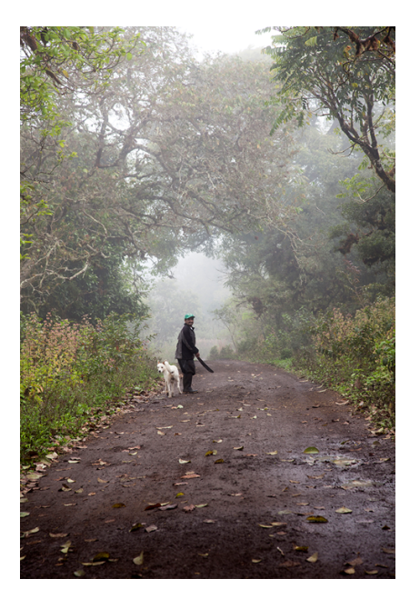
Fig 4. Floreana, "parte alta".