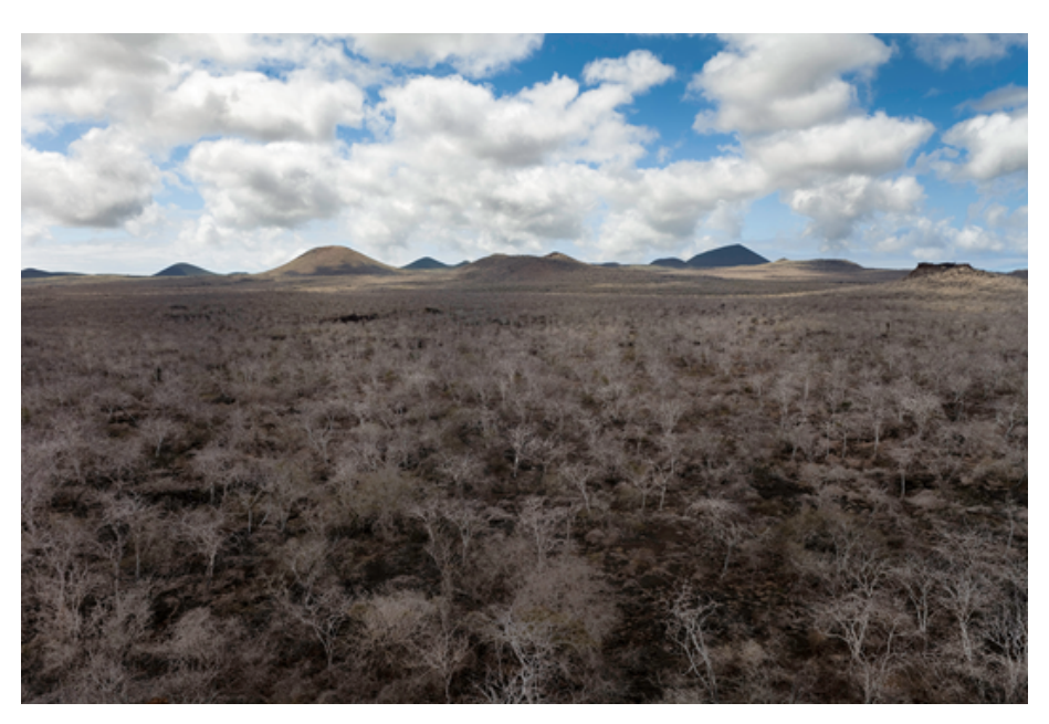
Fig 1. Floreana. Interior of the island.

up a fishing factory there, traces of which can still be seen today), with long periods of abandonment, in which wild cows, goats and donkeys grazed freely, as the island was used as a sporadic hunting reserve for adventurers and castaways.