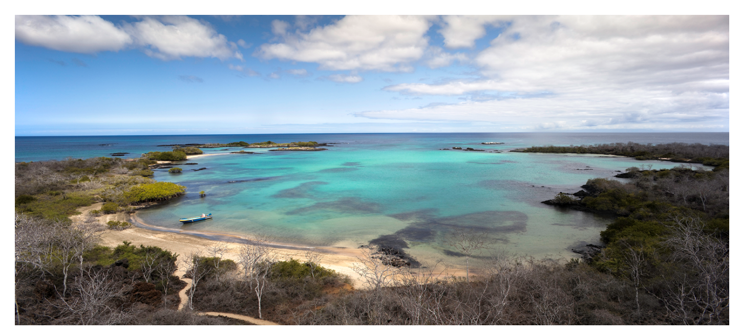
Fig 3. Beach in Floreana from the Baronesa's viewpoint.